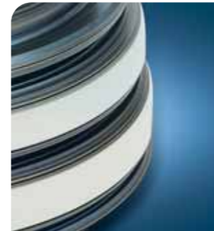
Plasma spray is applied to restore the damper wire groove.

HPC drums with wear at the damper wire groove are repaired using MTU's proprietary plasma spraying process. After dimensional inspection, the groove is machined and the plasma spray is applied. Final dimensional machining occurs prior to final inspection.