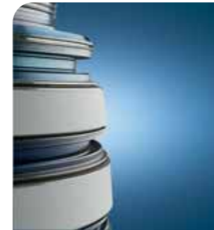
Part in restored condition.