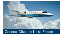
Cessna Citation Ultra Encore