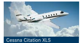
Cessna Citation XLS