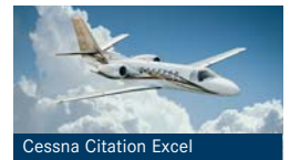
Cessna Citation Excel