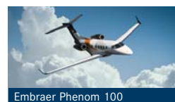
Embraer Phenom 100