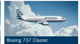
Boeing 737 Classic