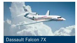
Dassault Falcon 7X