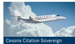
Cessna Citation Sovereign