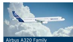
Airbus A320 Family