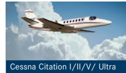
Cessna Citation I/II/V/ Ultra