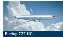
Boeing 737 NG