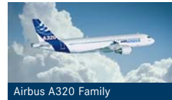
Airbus A320 Family