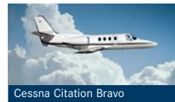
Cessna Citation Bravo