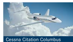
Cessna Citation Columbus