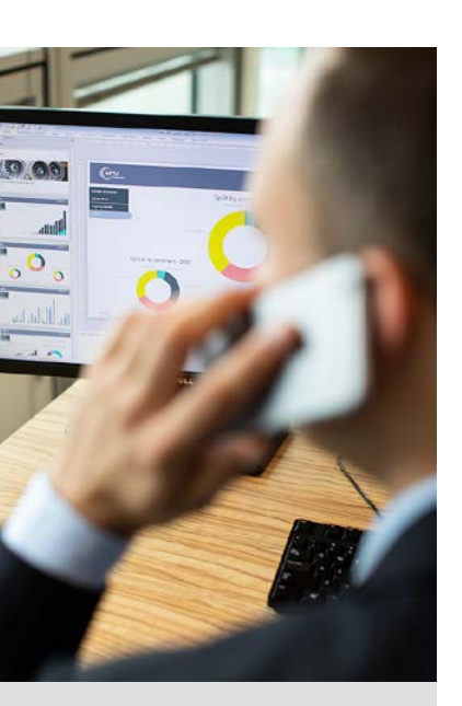
Contact: TAMS@ mtu-lease-services.com